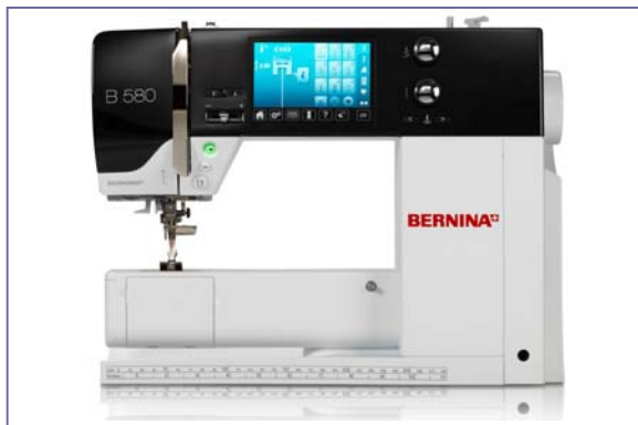
Sewing view is shown. Embroidery module is also included.